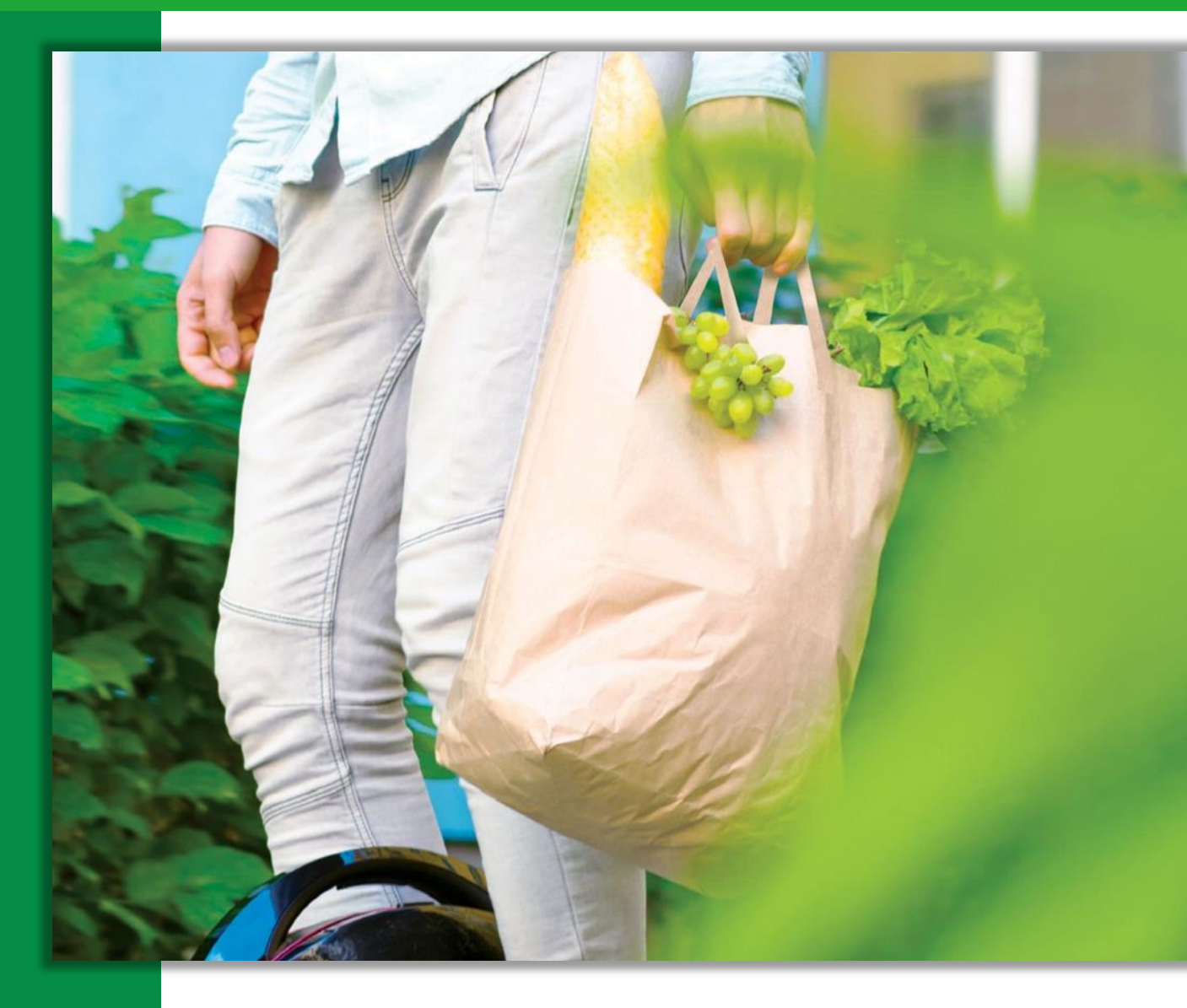
Products are recycled under the model of Reduce - Reuse - Recycle - for a friendly and sustainable environment.